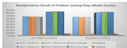
Figure 1. Recapitulation Result of Problem Solving Polya Model Success