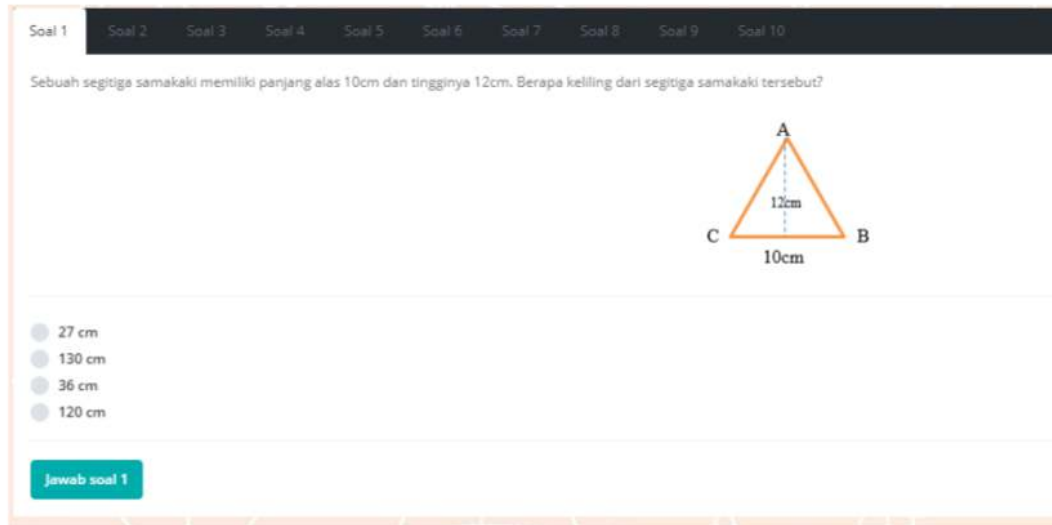
Figure 4. The display of evaluation questions

Figure 4 showed the display of evaluation questions students need to take to measure their understanding on geometry. There are ten multiple-choice questions on two-dimensional figures and geometry. The results of the evaluation can be directly accessed by the students.