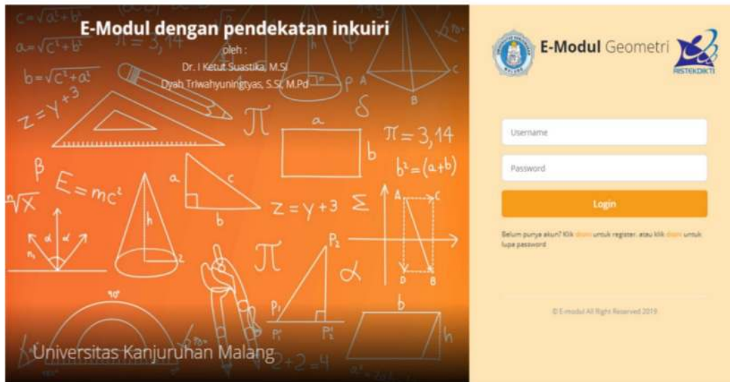
Figure 2. E-module main display

Figure 2 showed the main display of the geometry e-module. On the initial stage, students had to register using their identity. Thus, they could login using the username and password made before.