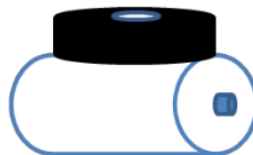
Figure 3. Shape battery and magnet.